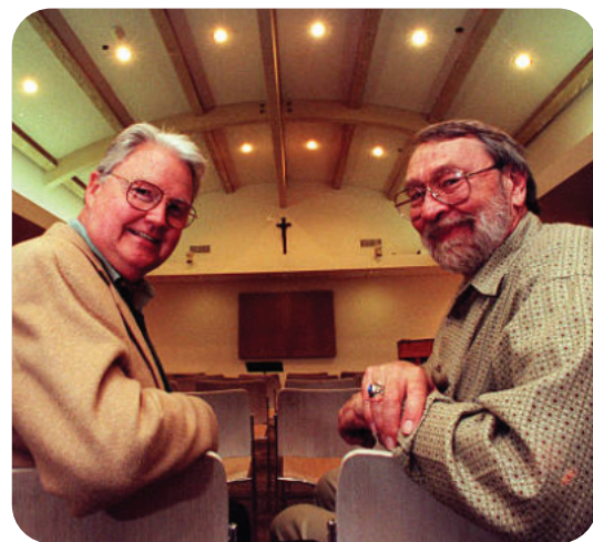
A candidate and his sponsor sit for a photo after an Order of Christian Initiation for Adults (OCIA) class.

I am happy you have responded to the stirrings of the Holy Spirit within you and answered the call to deepen your spiritual practice and journey. The Church needs you. The people of God welcome you. You are beloved among us, and your response in faith is a powerful witness, a reminder to those who may be tempted to take for granted the gift of faith. Thank you. ●