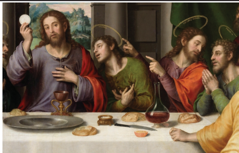
THE LAST SUPPER: JUAN DE JUANES (1560-1569)

To be clear, Jesus died to offer salvation to everyone, even though it's possible that some won't accept his offer. As the Congregation for Divine Worship and the Discipline of the Sacraments says: "'For many' is a faithful translation of pro multis, whereas 'for all' is rather an explanation of the sort that belongs properly to catechesis."