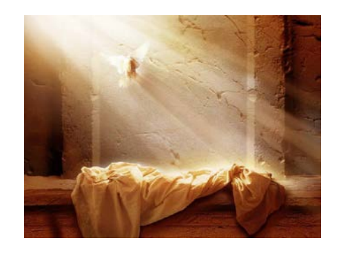
Wishing you all a Blessed Easter

source: New Saint Joseph People's Prayer Book