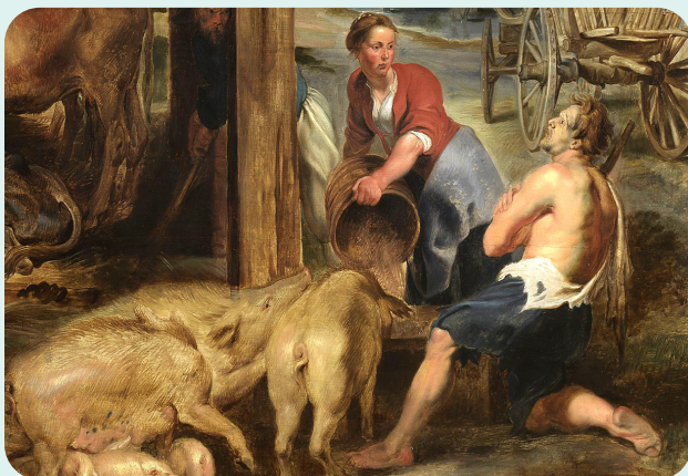
THE PRODIGAL SON, PETER PAUL RUBENS / WIKIMEDIA COMMONS