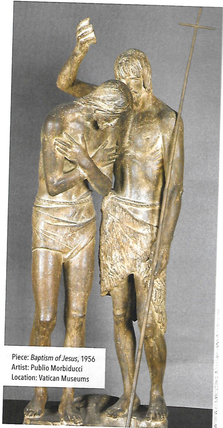
Piece: Baptism of Jesus , 1956 Artist: Publio Morbiducci Location: Vatican Museums

Am I courageous enough to ask the Holy Spirit to come down and touch my soul with his fire?